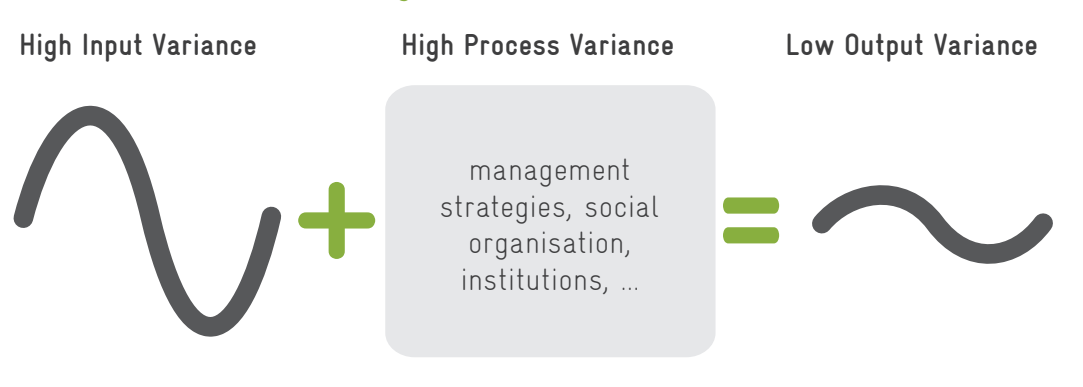
Figure adapted from Roe E. 2020. <u>A New Policy Narrative for Pastoralism?</u> <u>Pastoralists as Reliability Professionals and Pastoralist Systems as Infrastructure</u>, STEPS Working Paper 113, IDS, Brighton, United Kingdom.